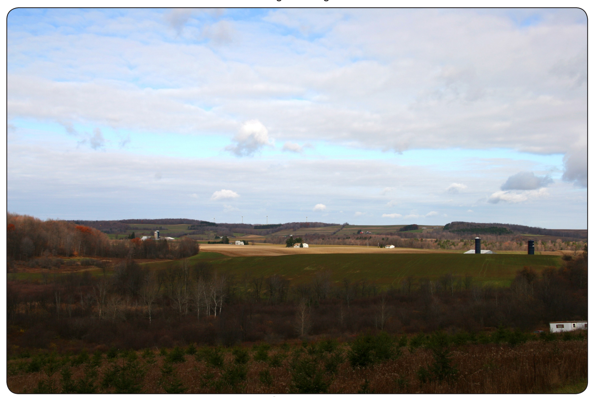
Figure 16: Visual Simulations Sheet 1 of 4

View from County Route 70 near the Hamlet of Howard, looking northwest.