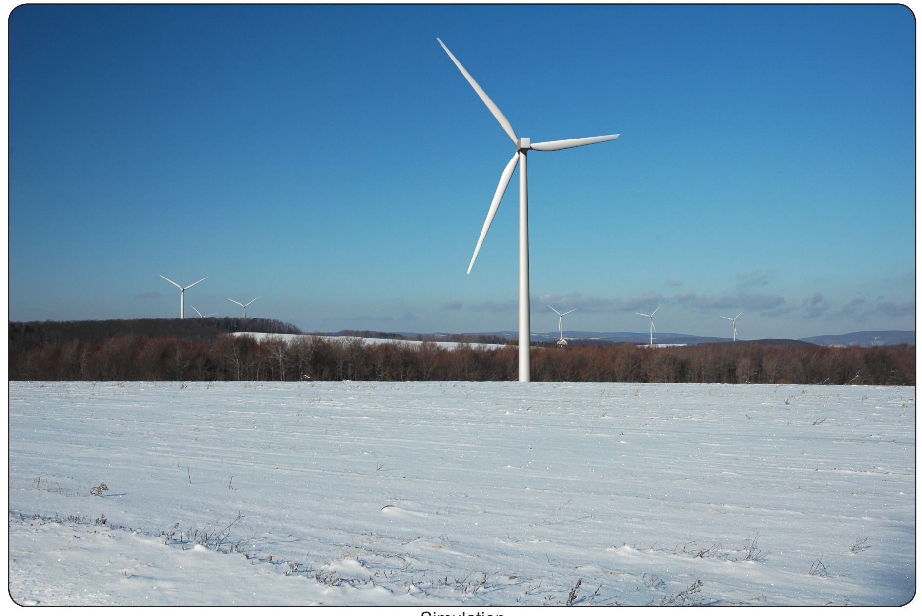
Figure 16: Visual Simulations Sheet 3 of 4

View from Kirkwoor-Lent Hill Road looking northwest.