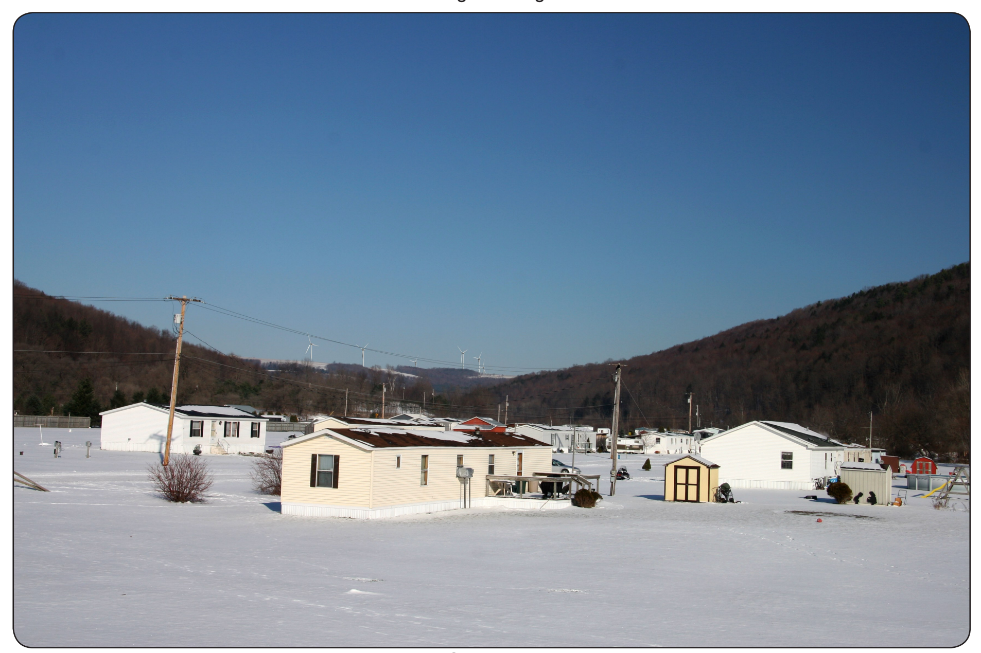
Figure 16: Visual Simulations Sheet 2 of 4

View from State Route 415 between County Route 9 and Hopkins Road, near the Hamlet of Wallace, looking north.